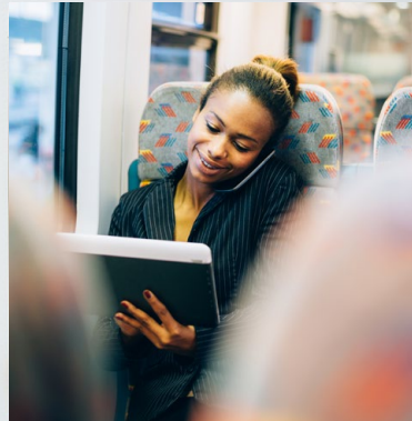
Working on the move