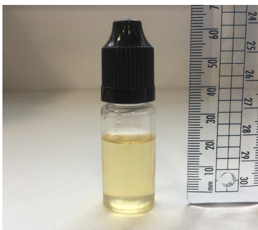
Sample (a) contained a liquid in a standard 10ml e-liquid bottle.

Samples involved in two of these incidents have been tested and found to contain synthetic cannabinoids . These are the laboratory made chemicals found in ' Spice '. It is extremely dangerous for a young person with no tolerance to inhale even a single dose of a potent synthetic cannabinoid .